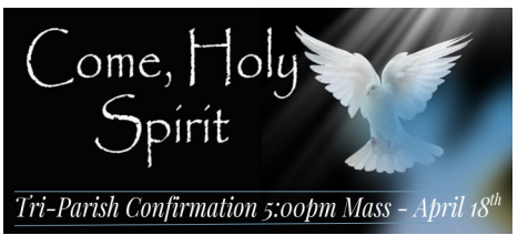
Tri-Parish Confirmation 5:00pm Mass - April 18th

Weekend Mass 8:00am (SPP) Intention: People of the Parishes Religious Ed. Preschool-4th 9am (PLC) Religious Ed. Pre/K Class 2 10am (PLC) Weekend Mass 10:00am (SPP) Intention: †Colleen Brouillette By Monte Brouillette & Family Tri-Parish Baptism Class 11am (PLC)