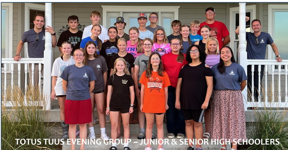
TOTUS TUUS EVENING GROUP ~ JUNIOR &amp; SENIOR HIGH SCHOOLERS