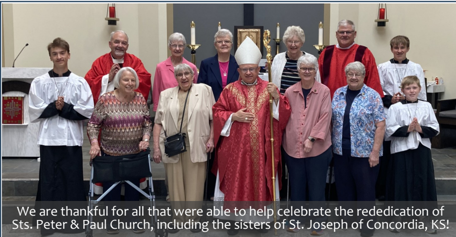
We are thankful for all that were able to help celebrate the rededication of Sts. Peter & Paul Church, including the sisters of St. Joseph of Concordia, KS!